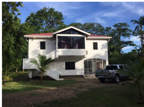
The Beautiful Lodge in Hopkins, Belize.

Permit are considered the most challenging and rewarding fish in the ocean. They move onto the flats when feeding and make for an exhilarating hunt with a fly rod. Once hooked up these fish will test the limits of your 9 or 10wt fly rod!