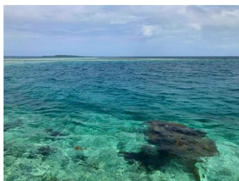
Incredible underwater landscapes - Troy Lichtenegger

Join your host Troy Lichtenegger of Raging River Sales, local PNW sales rep for Simms, Winston, Bauer, Echo, Airflo, Nautilus and Solitude on a private 6 person trip to southern Belize in pursuit of catching Permit on the fly!