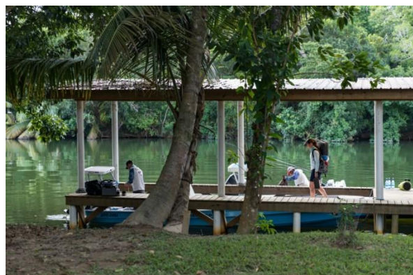
Gearing up for the day - Yellowdog Fly Fishing

If you would like further information please contact: troy@ragingriversales.com