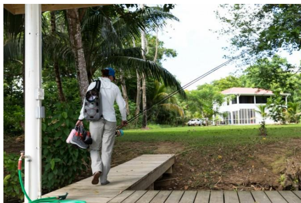
Back at the lodge - Yellowdog Fly Fishing

*Flight to Belize City and Dangriga not included